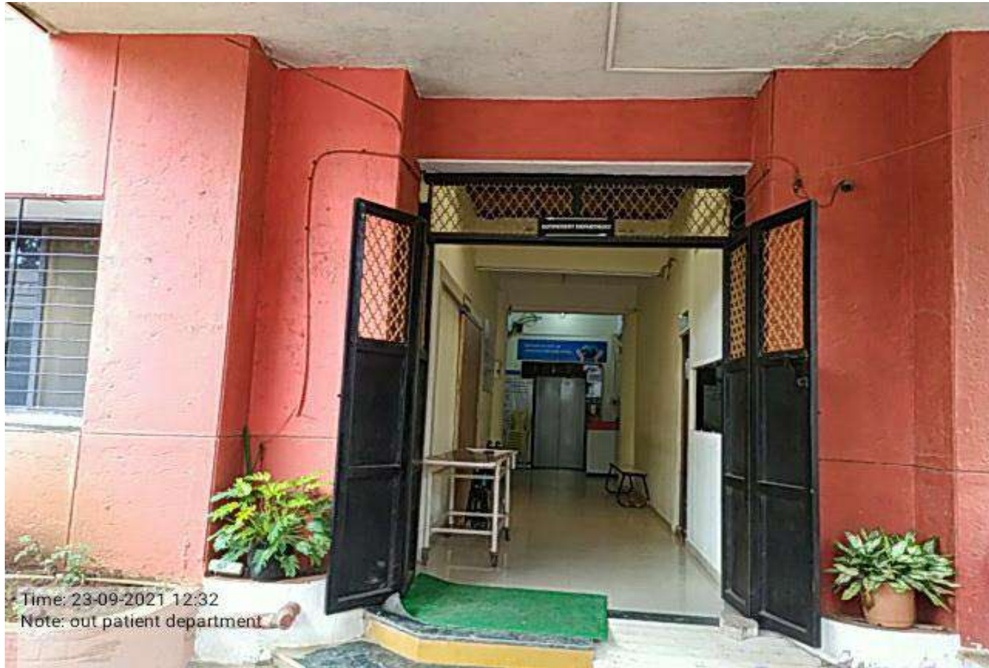
Time: 23-09-2021 12:32 Note: out patient department